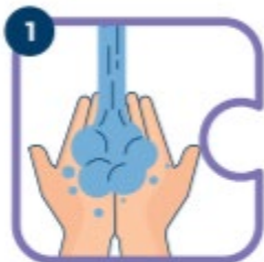
Wet your hands