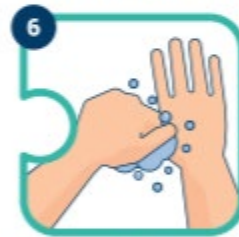
Base of thumbs