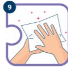
Dry with a towel