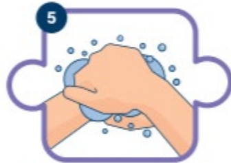
Back of the hand